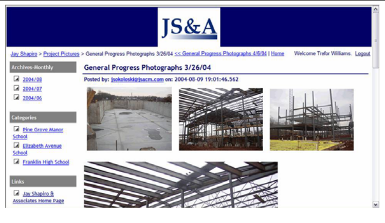
Weblog Progress Photography